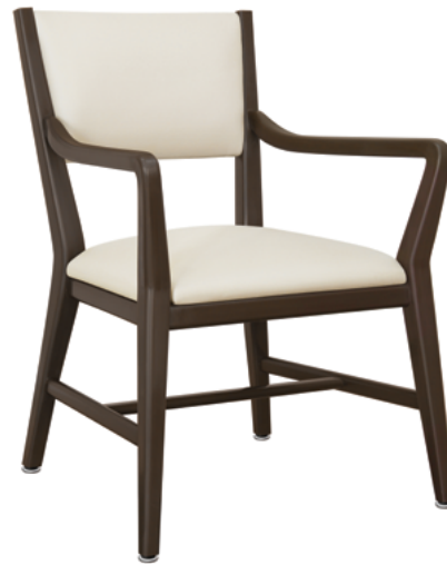
Model: CRG201BH 25.25W 27D 35H 19SW 19SD 19SH 26AH

Kwalu's Behavioral seating is built to psychiatric use specifications; durable and tamper-proof. Features include Kwalu's pick-proof polymer, steel reinforcement throughout the frame, concealed bottoms prevent access to any exposed staples or loose fabric and secured arm caps. Choose from two optional back styles – short or tall back. Optional concealed floor mounting available.